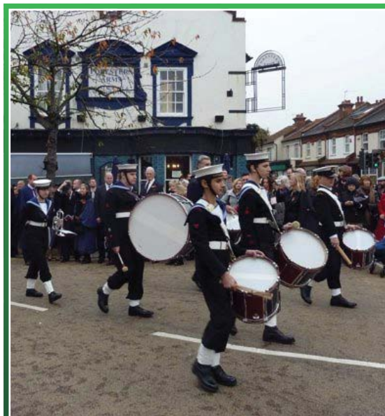
The Sea Cadets' Band at Remembrance Day 2010

The White Hart provides sandwiches and coffee to follow and all the other pubs will be open for those who want to stay and chat with friends and neighbours, particularly remembering those we have lost.