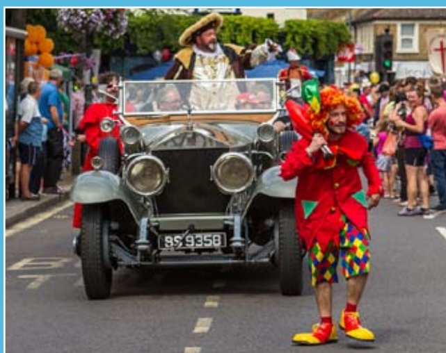
Leading the Grand Parade.

The Parade was led by a circus clown followed by Henry VIII in a stunning 1924 Rolls-Royce Silver Ghost. The rest of the Tudors followed, waving to the crowds who were six deep in places. Then came more vintage cars, stilt-walkers, a penny farthing, local organisations and charities marching along, lots and lots of people from the local churches, our councillors, military vehicles, a sailing boat and of course those gorillas!