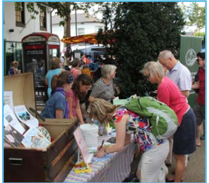
The HWA stall was busy all day.

Save the date for next year: 10th August 2014