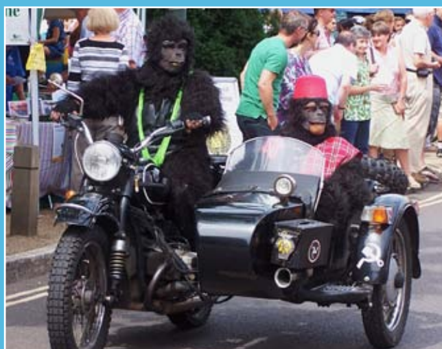
'Mr & Mrs' - Winner of the Photo Competition.