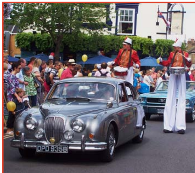
A Grand Day in Hampton Wick.

The highlight of the day was The Grand Parade, heralded by the pealing of church bell and some very loud fireworks! Then the Parade set off from Old Bridge Street, proceeding up the High Street to the station where it turned around for the return journey.