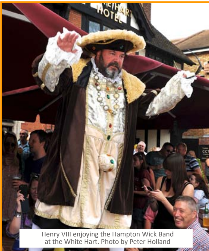
Henry VIII enjoying the Hampton Wick Band at the White Hart.