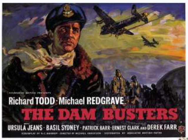
1954 movie poster